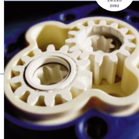
Full Ceramic Pump